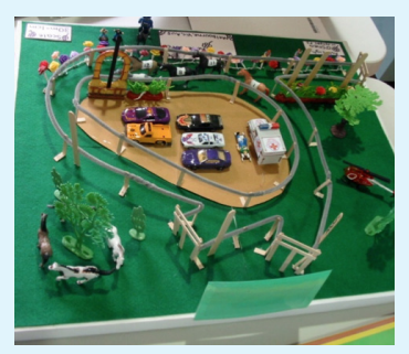
An MTQ entry.

The Maths Talent Quest (MTQ) is an integral component of the student activities program. The program caters for student diversity when investigating mathematical topics and connecting them to the real world. The MTQ enables and empowers each participant to use a variety