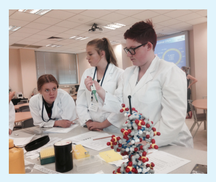
Year 10 Maths Camp students engaged in an activity at GTAC.

This highly successful maths camp was developed in partnership with seven diverse mathematical industry leaders (IBM, Reserve Bank Australia, DOWNER EDI, Gene Access Technology Centre (GTAC), Ford, ACER, and CSIRO).