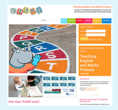
The TEAM:P website.

The main focus of the TEAM:P project has been professional development, and as such the future of the TEAM:P website is under consideration.