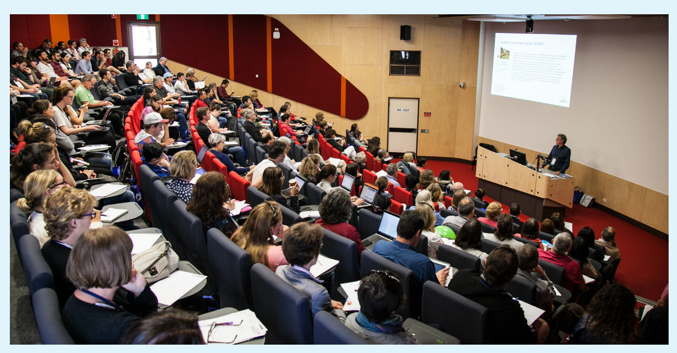
A keynote session at The MAV's 2016 annual conference.